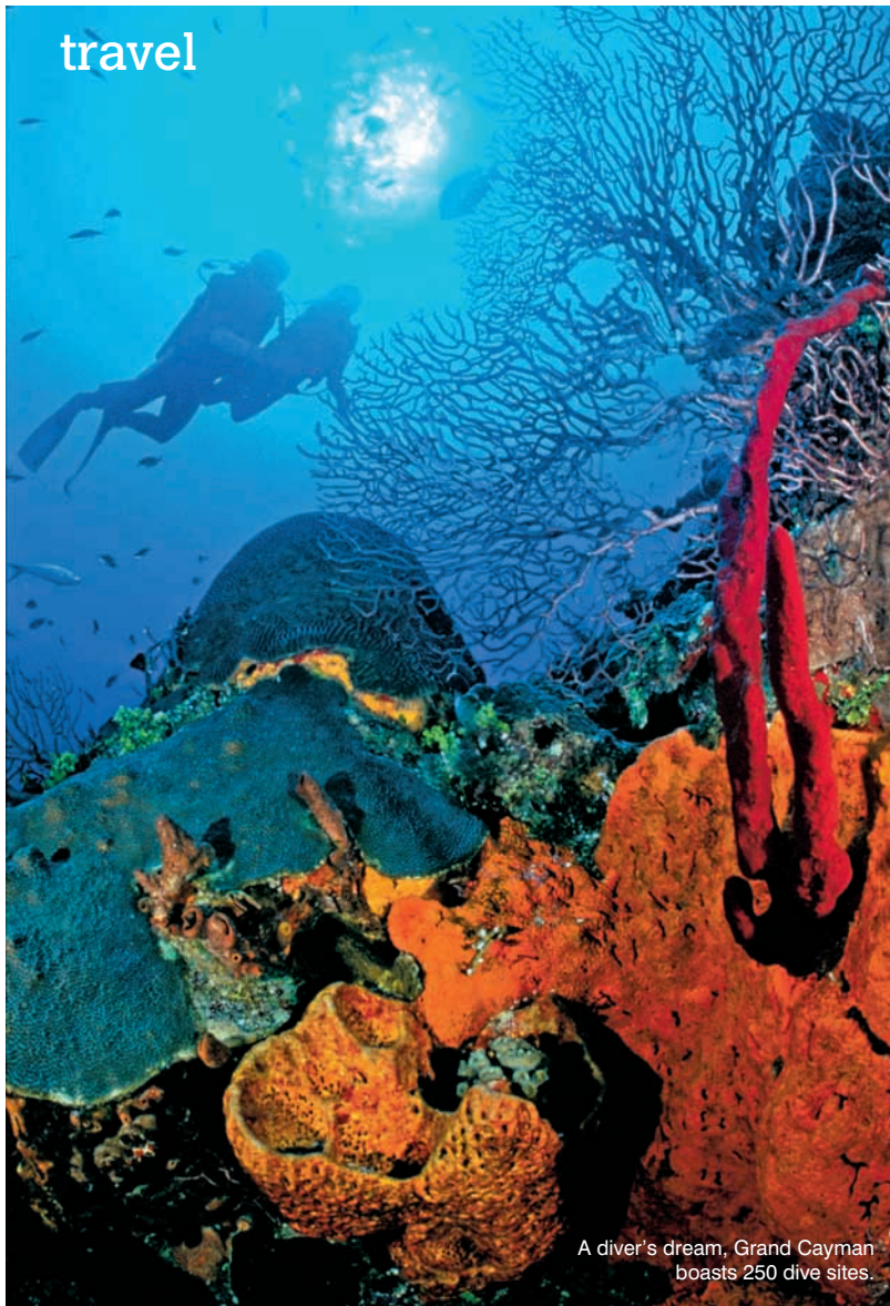
A diver's dream, Grand Cayman boasts 250 dive sites.