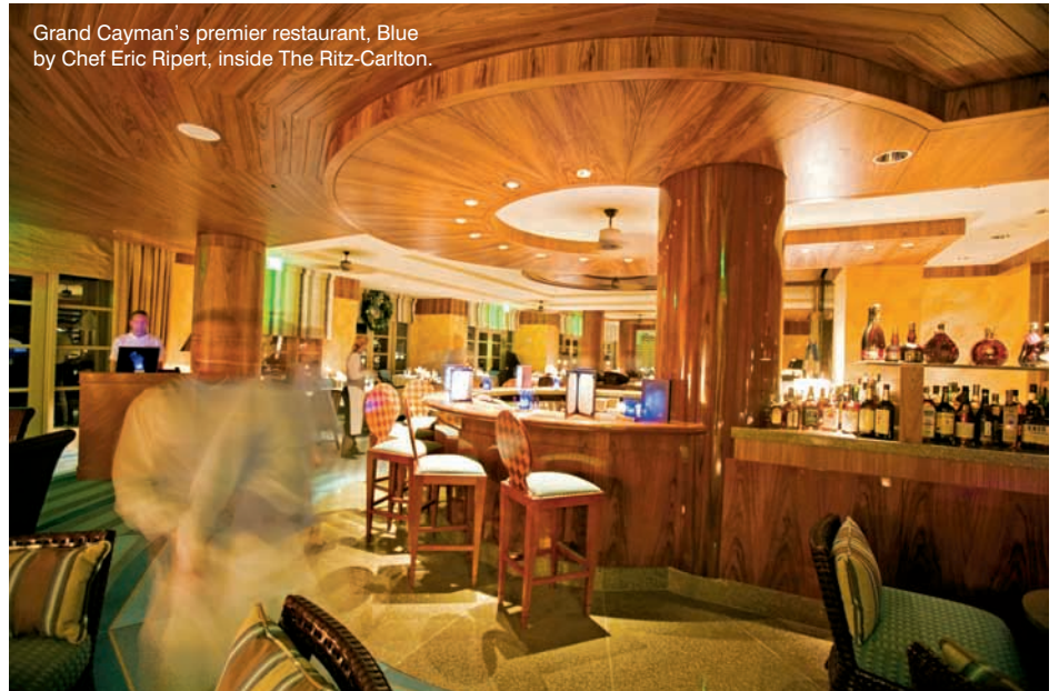
Grand Cayman’s premier restaurant, Blue by Chef Eric Ripert, inside The Ritz-Carlton.

A large, open-air lobby welcomes guests. Spacious guest rooms are designed with relaxation in mind. We’re talking private balconies, quality furnishings and lush fabrics. King rooms are equipped with a loveseat that converts to a single bed; double rooms offer two queens. Amenity-laden bathrooms are signature Ritz with black and white marbling and a welcome separation between bathtub and shower. High-speed Internet access is available for those who need it; those who don’t will find respite on their room’s private balcony, a great place to gaze at the water and relax. In the evening, guests drift to sleep in possibly the most comfortable bed of all time—dressed in signa-