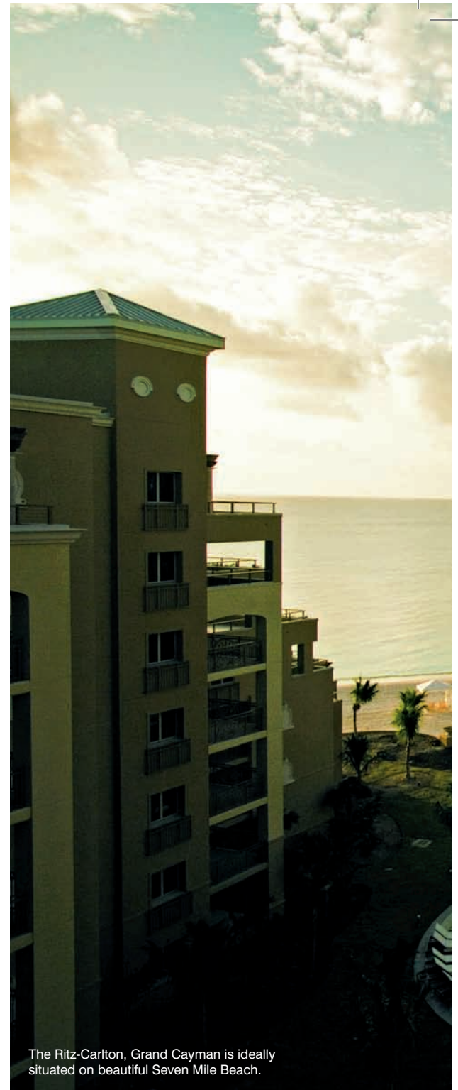
The Ritz-Carlton, Grand Cayman is ideally situated on beautiful Seven Mile Beach.

Not too far off the coast of Grand Cayman is one of the island’s most famous shallow dive sites: Stingray City. Known as the “world’s best 12-foot dive,” more than two dozen tame stingrays swim through the water, allowing visitors to stroke their silky skin. While some might find this an iffy proposition, once the initial squeamishness passes, it is one of the most peaceful encounters a person will ever have. A catamaran trip is a great way to explore this popular spot. If you’re not up for scuba diving but want a bit