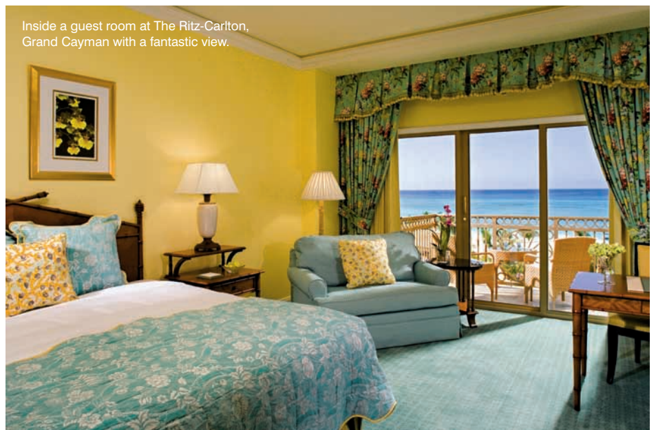
Inside a guest room at The Ritz-Carlton, Grand Cayman with a fantastic view.