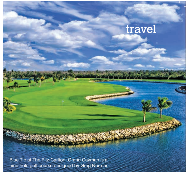
Blue Tip at The Ritz-Carlton, Grand Cayman is a nine-hole golf course designed by Greg Norman.

Chef Eric Ripert (a seafood specialist); Silver Rain, the 20,000-square-foot Swiss-inspired La Prairie Spa; a Nick Bollettieri tennis center with clay and grass courts; and the Greg Norman-designed Blue Tip golf course. Those with little ones in tow will appreciate the “Ambassadors of the Environment” program. Developed by Jean-Michel Cousteau and the Ocean Futures Society, this unique offering enables children to explore the Caribbean in a monitored environment that is entertaining, educational and eco-safe. Also available on-site is a trend-setting beauty salon, state-of-the-art fitness center, oceanfront free-form pool with private cabanas, lagoon side pool, shopping and the island’s largest indoor/outdoor special events area.