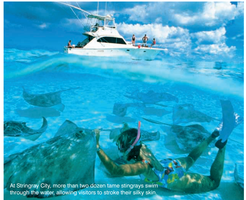
At Stringray City, more than two dozen tame stingrays swim through the water, allowing visitors to stroke their silky skin.