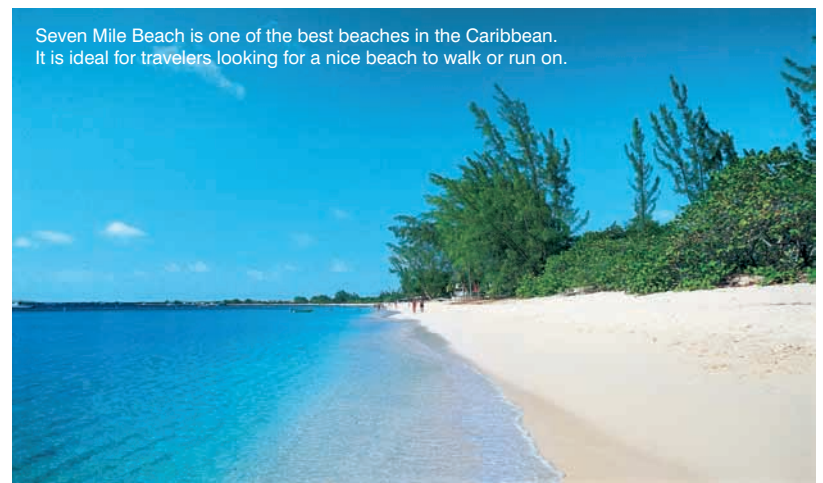
Seven Mile Beach is one of the best beaches in the Caribbean. It is ideal for travelers looking for a nice beach to walk or run on.

an impressive $500 million funneled into resort and residence construction. Situated on the most sought-after spot on Seven Mile Beach, owners of these prime oceanfront homes enjoy breathtaking views of perfectly hued waters, miles of shoreline, carefree days and evenings, an enviable amenity package, and the at-a-moment's-notice service for which the Ritz is rightfully famous.