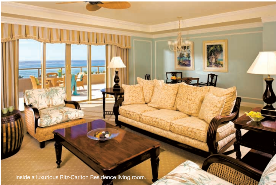
Inside a luxurious Ritz-Carlton Residence living room.